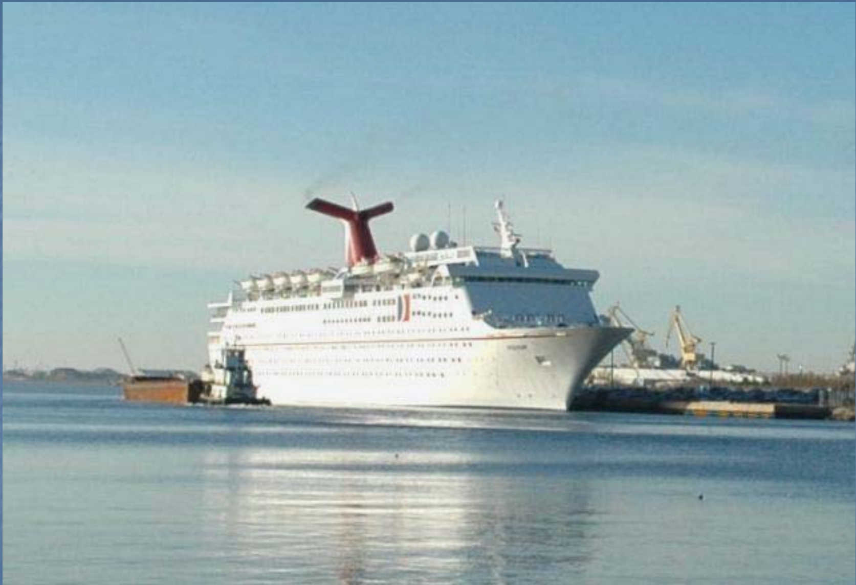
Holiday – Carnival Cruise Lines