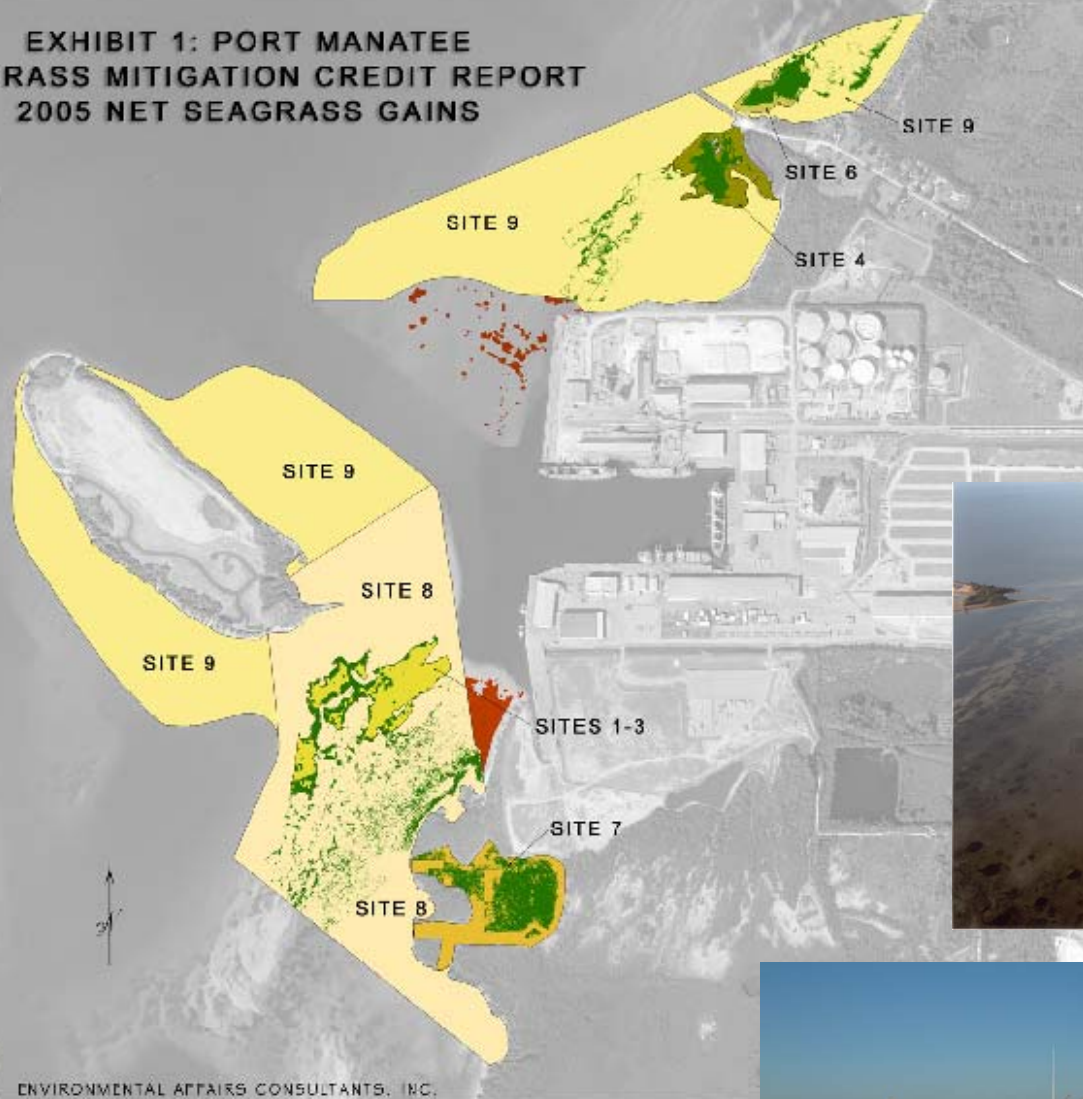
EXHIBIT 1: PORT MANATEE SEAGRASS MITIGATION CREDIT REPORT 2005 NET SEAGRASS GAINS